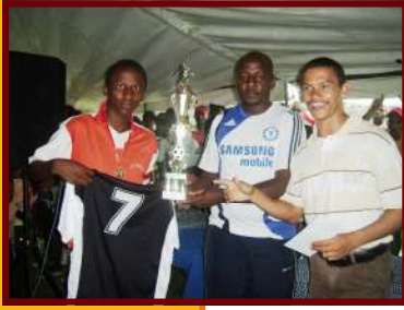
Handing over the Cup to the winner