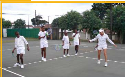
Boys & Girls getting coached in tennis

If any other sporting organization (cricket, baseball, rugby, ballet, etc) would like to train and develop our children in sports, please let us know.