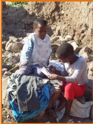
Children doing homework outside in the rubble